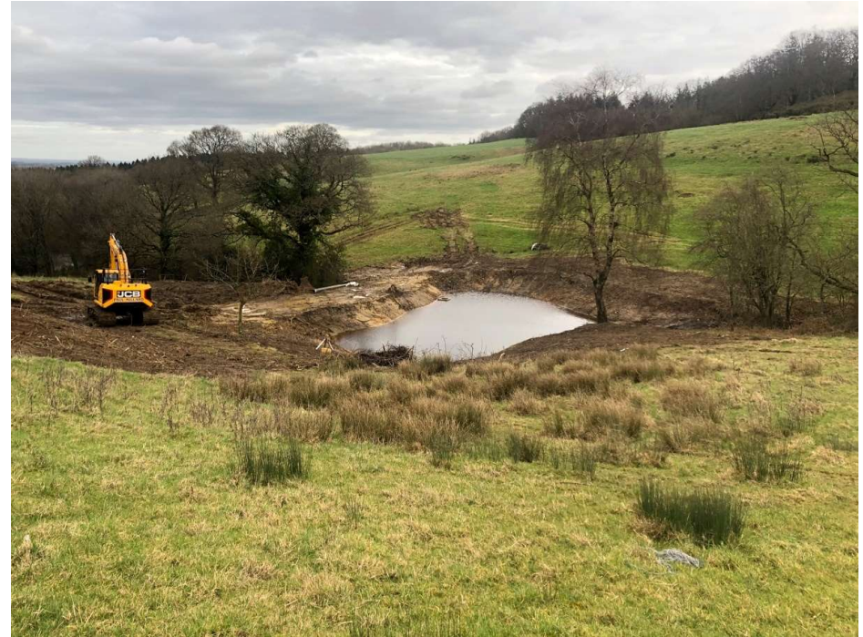
Above: Pond at Witham Friary near Frome